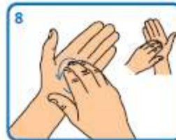
8 Rub tips of fingers in opposite palm in a circular motion