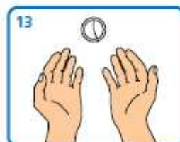
13 Hand washing should take 15–30 seconds