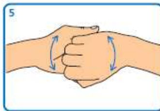
5 Rub back of fingers to opposing palms with fingers interlocked