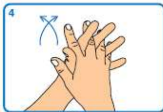
4 Rub palm to palm with fingers interlaced