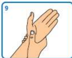
9 Rub each wrist with opposite hand