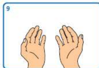
9 Wait until product has evaporated and hands are dry (do not use paper towels)