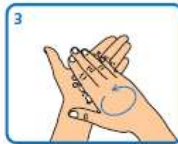
3 Rub hands palm to palm