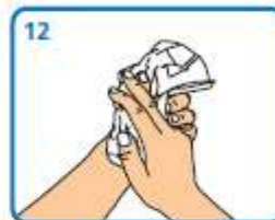
12 Dry thoroughly with a single-use towel