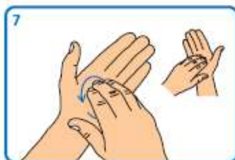
7 Rub tips of fingers in opposite palm in a circular motion