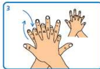
3 Rub back of each hand with palm of other hand with fingers interlaced