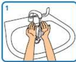
1 Wet hands with water