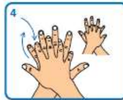
4 Rub back of each hand with palm of other hand with fingers interlaced