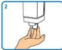
2 Apply enough soap to cover all hand surfaces