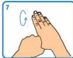
7 Rub each thumb clasped in opposite hand using a rotational movement