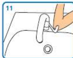
11 Use elbow to turn off tap