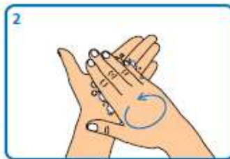
2 Rub hands together palm to palm, spreading the handrub over the hands