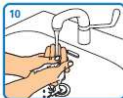
10 Rinse hands with water