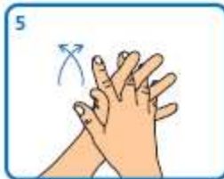
5 Rub palm to palm with fingers interlaced