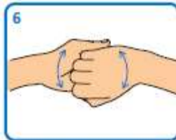
6 Rub with back of fingers to opposing palms with fingers interlocked