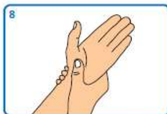
8 Rub each wrist with opposite hand