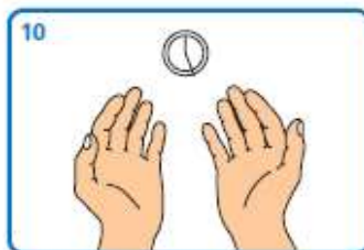
10 The process should take 15–30 seconds