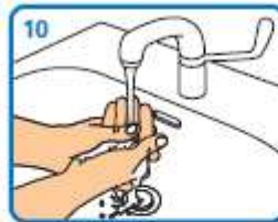
10 Rinse hands with water