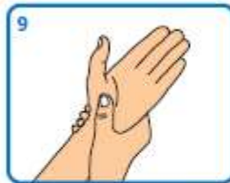
9 Rub each wrist with opposite hand