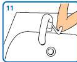
11 Use elbow to turn off tap