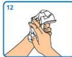
12 Dry thoroughly with a single-use towel