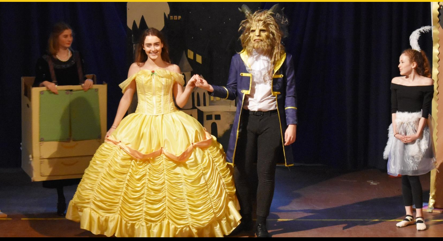
School Show Beauty and The Beast JR.