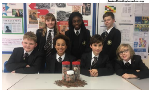
Year 7 Change Maker Students