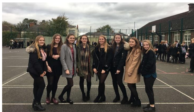
Macmillan Cancer Support Leadership Team.