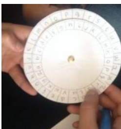
Trying different shifts using a Caesar cipher wheel