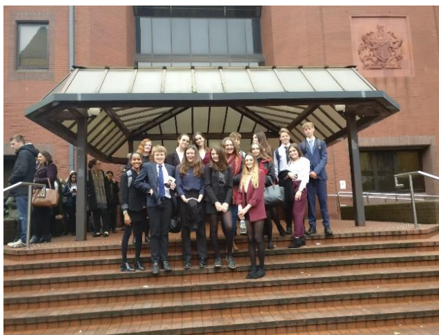
Year 10 students in Birmingham for the Bar Trial Competition