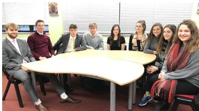
Senior Students Leadership Team