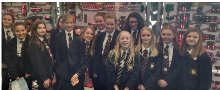
Students visiting The Centre for Computing History

Fourteen Key Stage 3 students travelled to The Centre for Computing History in Cambridge on Thursday, 12 October 2017 to attend an IT event which was part of the Centre's festival 'Computing History: Where did all the Women Go?' The event aimed to encourage girls to engage with technology and STEM. This was an evening event starting with a live play of Ada Lovelace, followed by a STEM networking session; focusing on women from the past and women currently working in STEM fields. Ada Lovelace wrote the world's first complex algorithm in 1843 and was then written out of history. The performance told her story using an LED dress which was operated live on stage, using her wearable tech satin glove. Ada.Ada.Ada exists to help people, especially girls and women, engage with technology and stem as a career. The event explained why everyone should get involved with computers to help create our future!